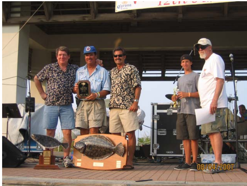
1st place, team Paige II