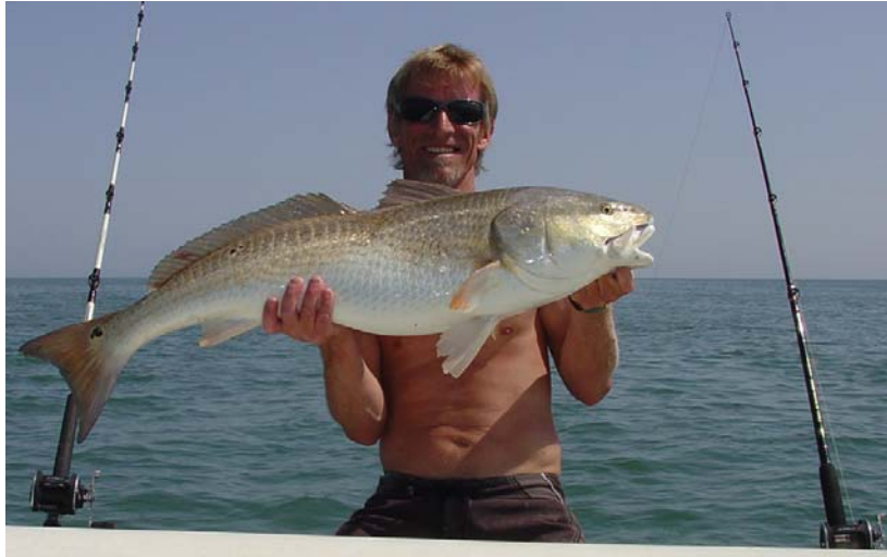
Cobia!! Image was taken last summer.

The Red Drum are back! I caught this one on a recent trip in 9 foot of water on cut Croaker.