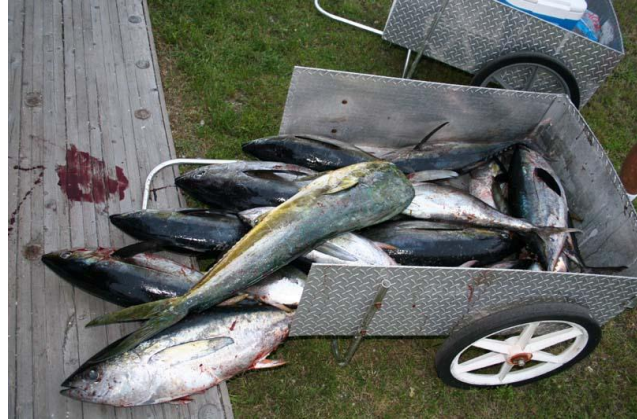
A Cart Full of Palagics