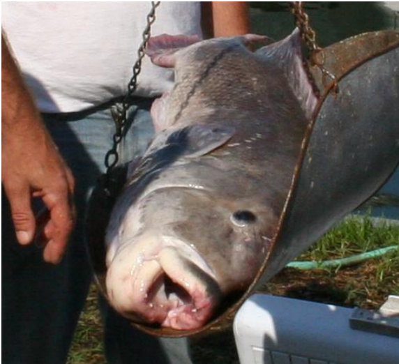
Team Knuckle Heads Paper Tog