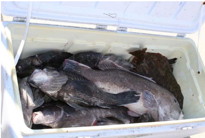
Team Knuckle Heads Cooler Full