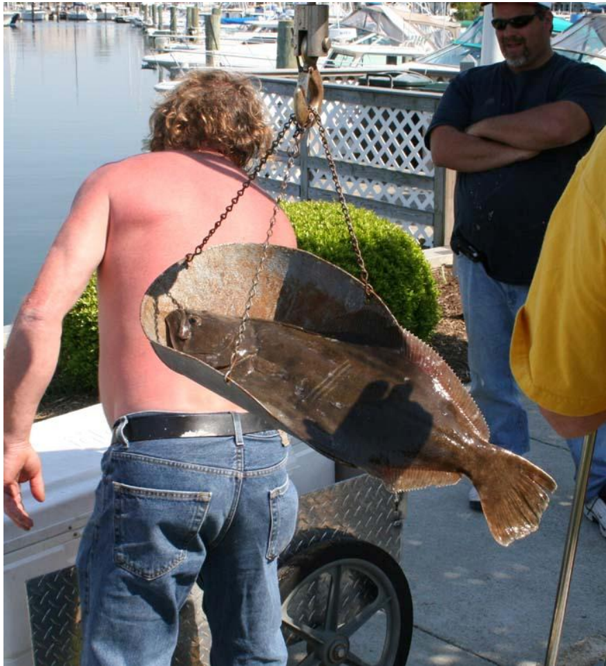
The Winning Flounder – VERY NICE