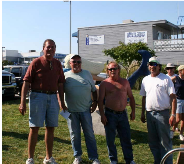
Hooked Up Louis and Crew took 1 st Place