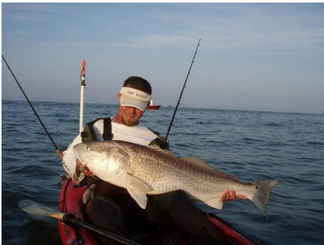
Kayak Kevin's 47" Red Drum Citation