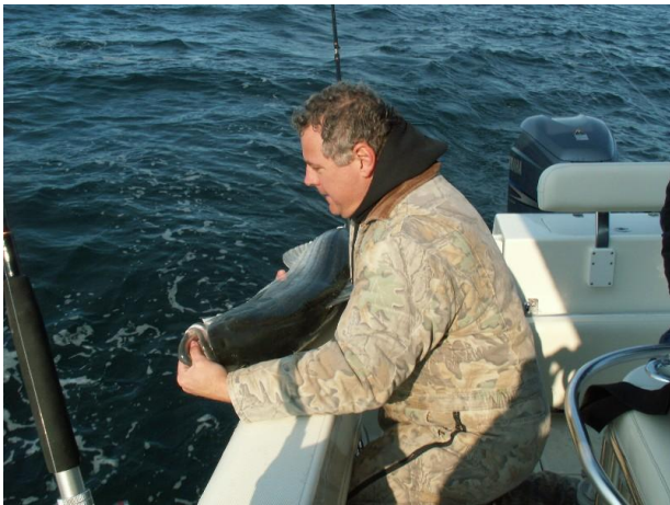
I released him go to grow up