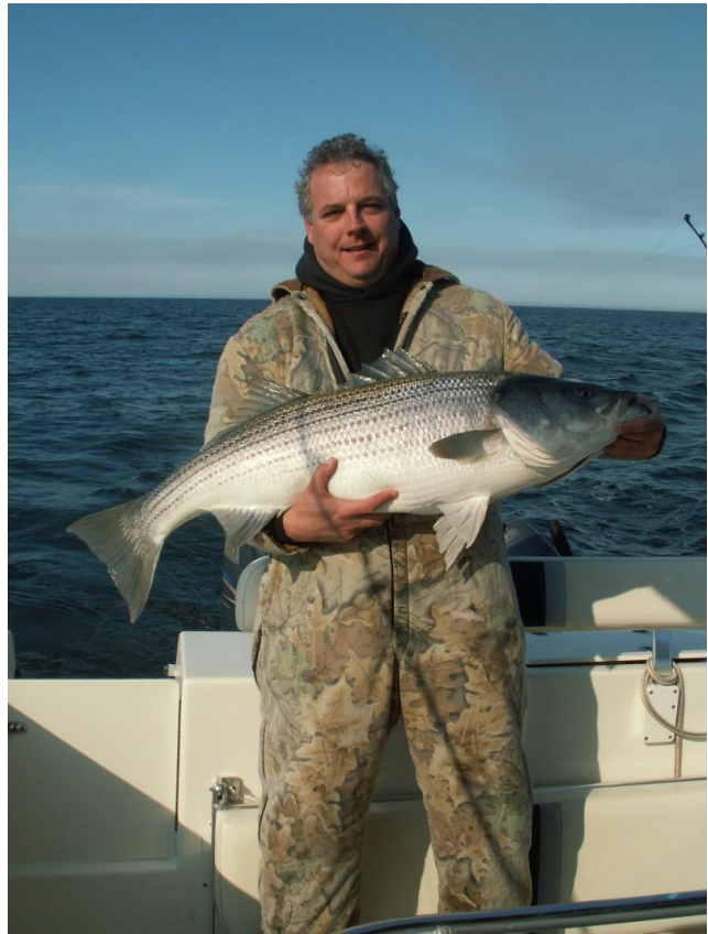
Me before the release